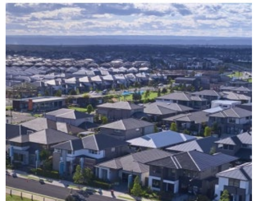
Marsden Park by Stockland