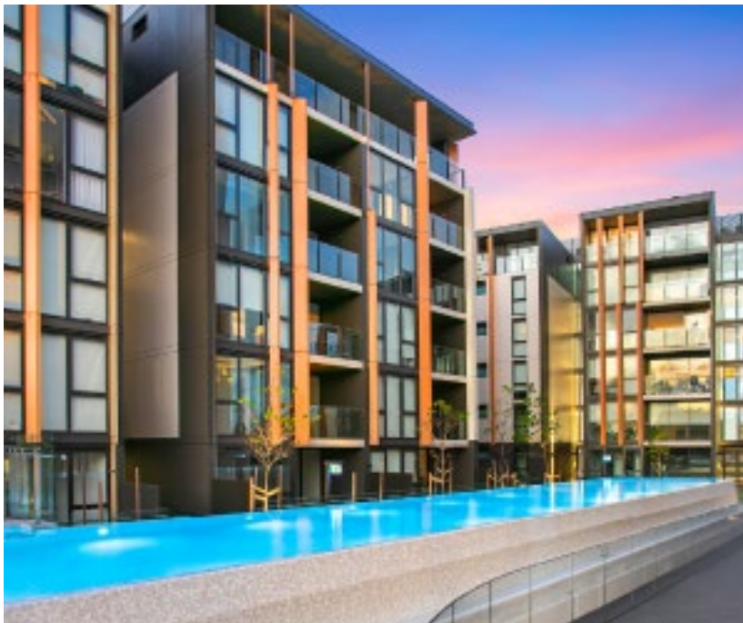
The Grand, Eastlakes by Crown Group

Urban Taskforce Australia Ltd. ABN: 21 102 685 174 | GPO Box 5396 Sydney NSW 2001