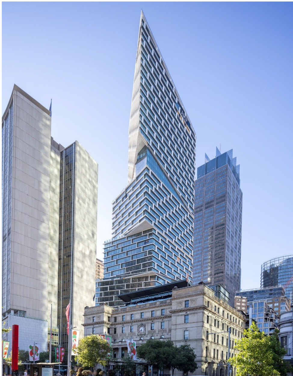
2022 Development of the Year – Quay Quarter by AMP Capital.

The awards are a prestigious networking event and an industry favourite.