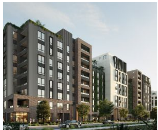
Navali, Penrith by Urban Property Group