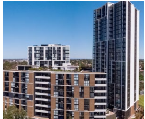
Highline Westmead by Deicorp

Core member company representatives on the Taskforce are chief executives, directors and senior executives. This assists company representatives to network with their peers across property development industry.