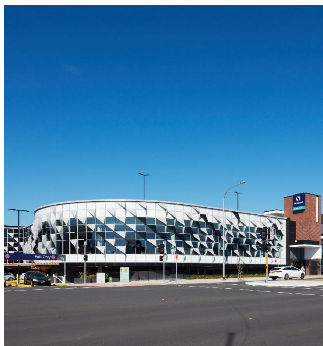
Stockland Green Hills, Stockland