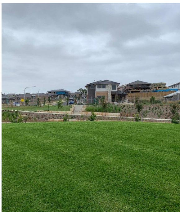
Caddens Hill, Legacy Property