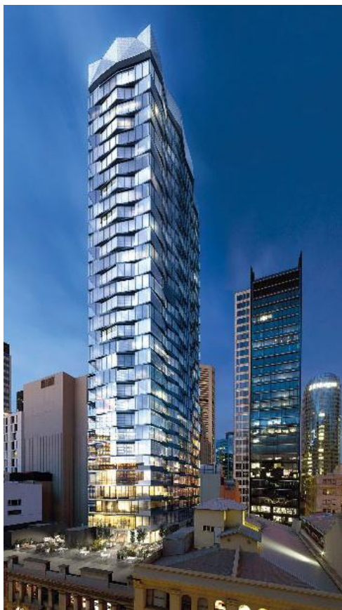
YORK&GEORGE, Fife Capital