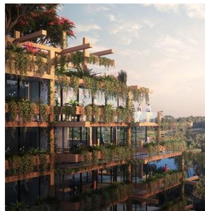
One Sydney Park by HPG