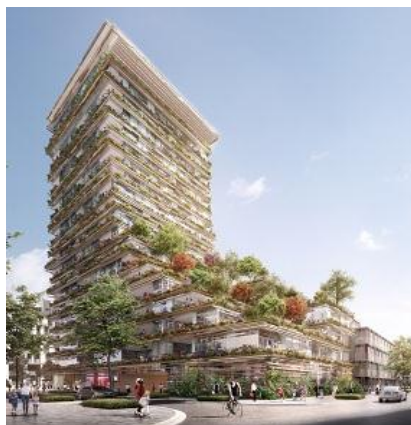
Waterloo Project by Crown Group